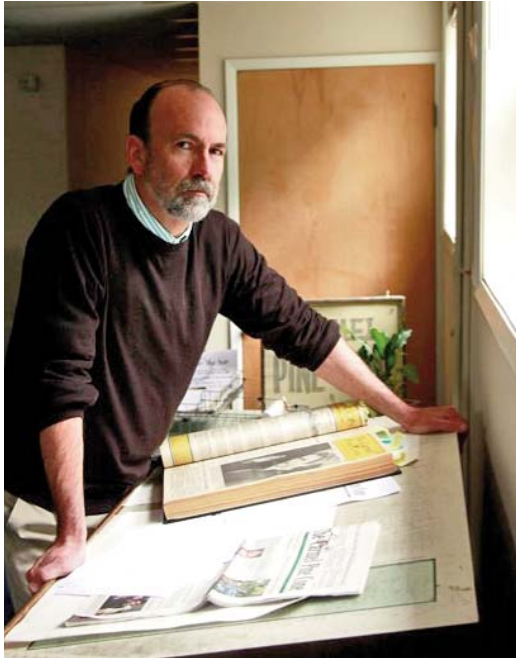
In The Carmel Pine Cone newsroom (2010).

YOUR SOURCE FOR LOCAL NEWS, ARTS AND OPINION SINCE 1915